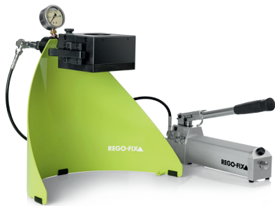
PGC 2506 Unit Manual clamping unit with handpump