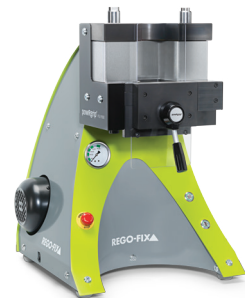
PGU 9500 Unit Automatic clamping unit